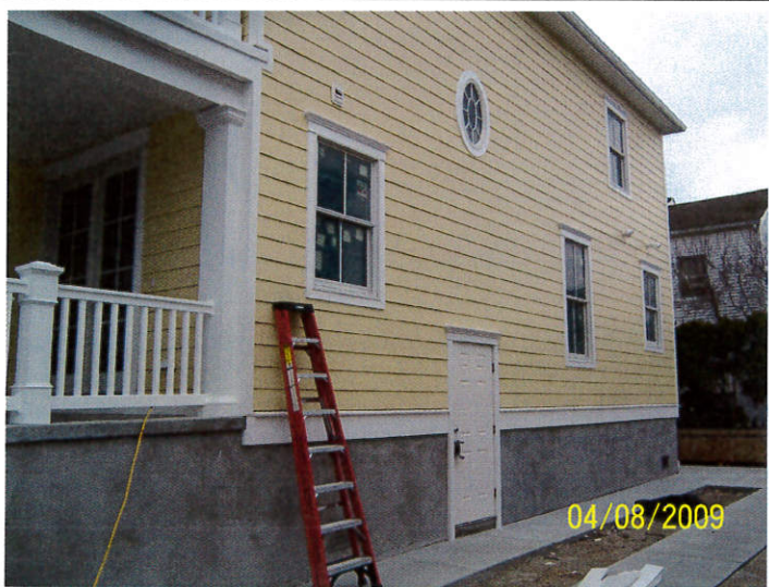
Right Side View – Date of Photograph: (See Photo Stamp)