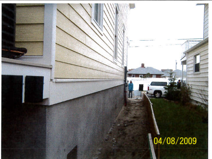
Left Side View – Date of Photograph: (See Photo Stamp)