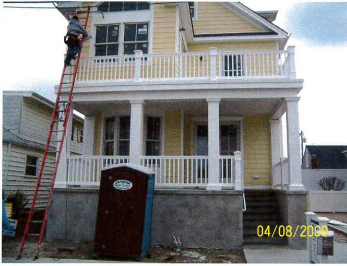
Front View – Date of Photograph: (See Photo Stamp)

If using the Elevation Certificate to obtain NFIP flood insurance, affix at least two building photographs below according to the instructions for Item A6. Identify all photographs with: date taken; "Front View" and "Rear View"; and, if required, "Right Side View" and "Left Side View." If submitting more photographs than will fit on this page, use the Continuation Page, following.