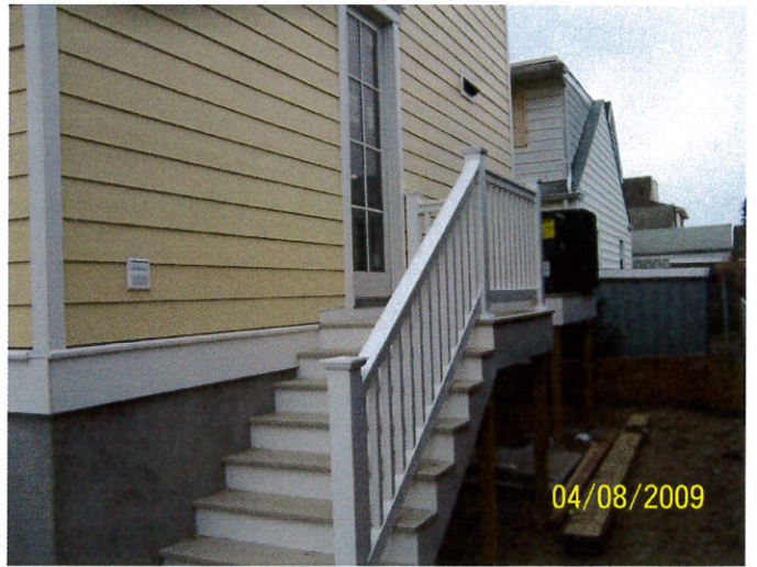
Rear View – Date of Photograph: (See Photo Stamp)